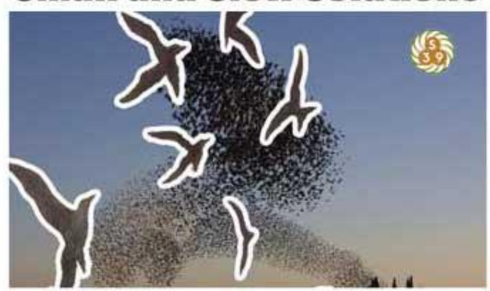
Unleashing the Creativity of the Climate Change Generation