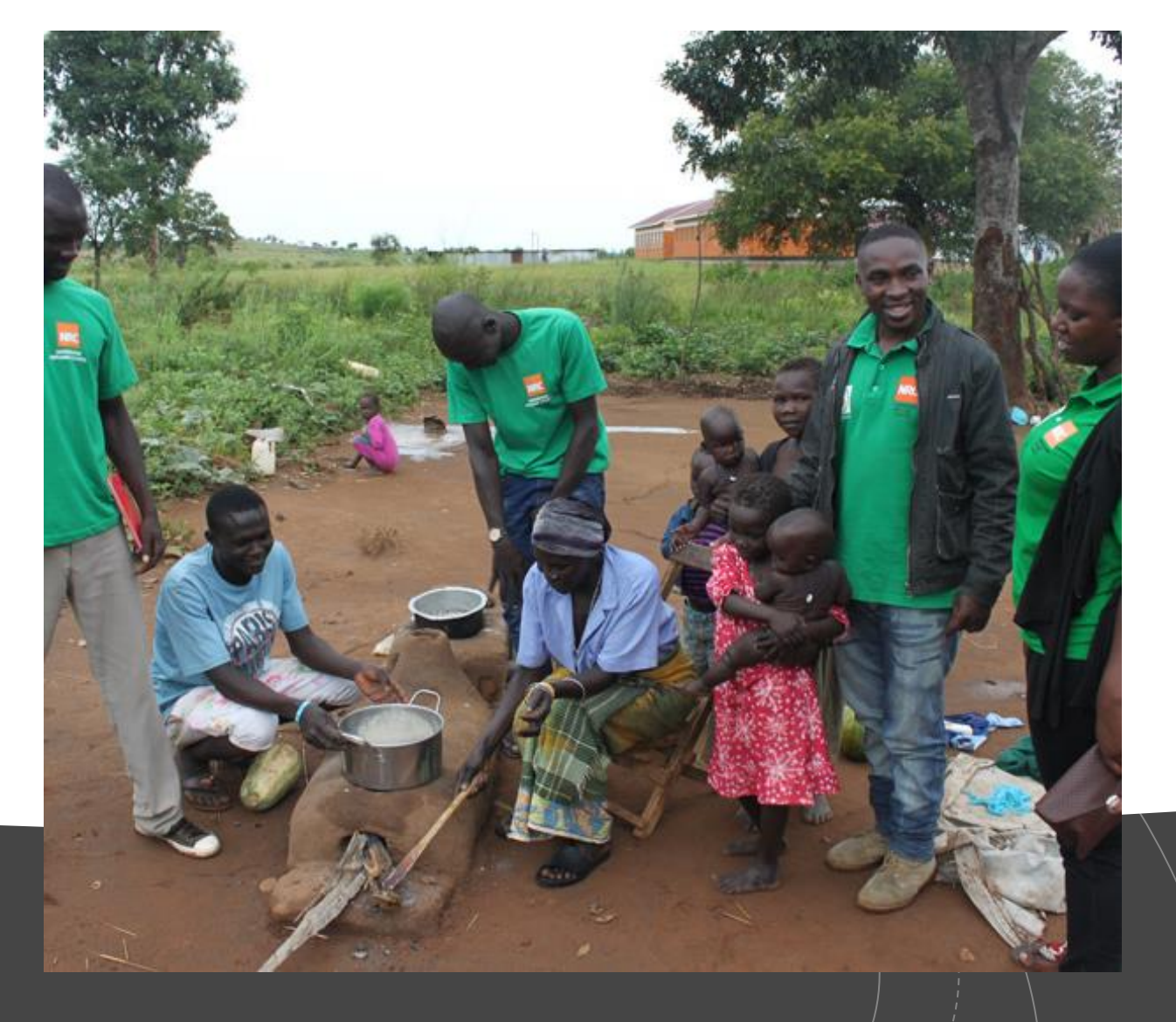
Training team in Bidibidi with low energy stove design